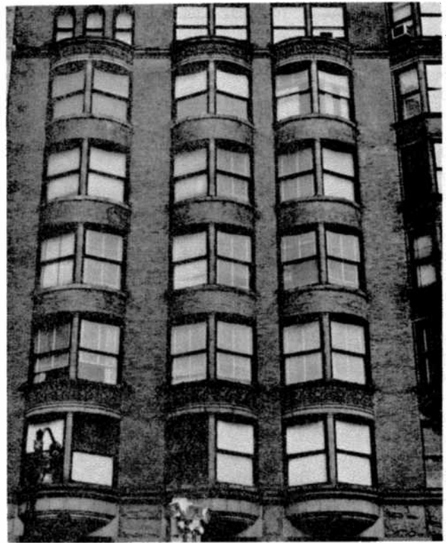
These photographs show two types of projecting windows which are found on the main facade of the Manhattan Building.

The most prominent feature of the facade is the diversity of window shapes. Although all the windows above the ground floor are double-hung, they vary greatly in size and arrangement. From the fifth through the eleventh story, the three center bays contain projecting trapezoidal windows. On either side of this group, from the fourth through the eighth stories only, the three bays of projecting windows are rounded. The remaining windows are all paired and are flush with the surface of the building. The organization of windows appears to lack coherence, yet the arrangement was intended to create more interior space above the public sidewalks and to capture as much light as possible for the offices not in direct line with a source of light. At the time of construction, Jenney was concerned that the two buildings under construction across the street (both now demolished), which were to be twelve and thirteen stories tall, would block the normal source of light. Consequently his design reflects a pragmatic attempt